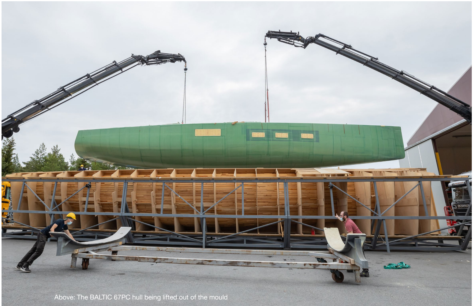
Above: The BALTIC 67PC hull being lifted-out of the mould