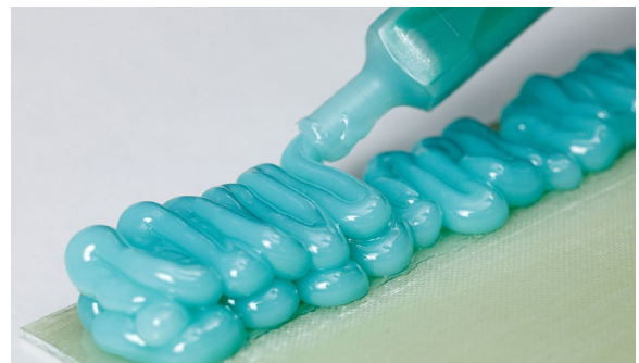
Left: Gurit SPRINT™ construction. Above: Spabond™ adhesive used for structural bonding

To further lightweight the hull structure, the Corecell™ M foam which formed the centre of the sandwich construction was thermoformed to the correct shape, considerably reducing resin uptake. Corecell™ M foam is a SAN structural foam core, well known for its unmatched toughness and impact resistance, making it the perfect choice for slamming areas such as hulls. To complement the use of Gurit SPRINT™ and Corecell™, a full range of Gurit epoxy resins and adhesive products were used for the fit out, including: Gurit mono component paste for bridging any gaps between the Corecell™ and SPRINT™ and creating seamless fillets, and Ampreg™ 31 Laminating system and Spabond™ structural adhesive for securing bulk heads in place and structural bonding.